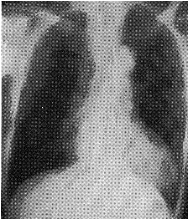
Fig. 1. Chest radiography on admission. The chest radiography showed cardiomegaly (cardiothoracic ratio=60%), but no pulmonary edema.